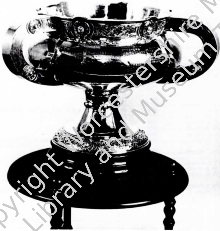
The Lodge Loving Cup